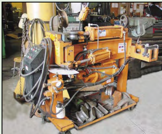
HUTH MDL. 2801 HYDRAULIC TUBING BENDER, WELL TOOLED