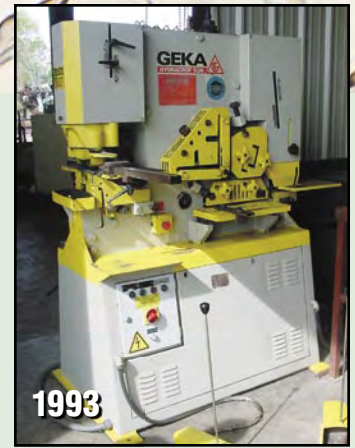
1993 GEKA HYDRACORP MDL. 50/A 50-TON IRONWORKER