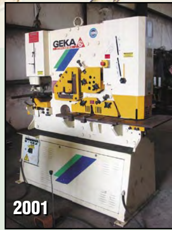
2001 GEKA HYDRACORP MDL. 110/A 110-TON IRONWORKER