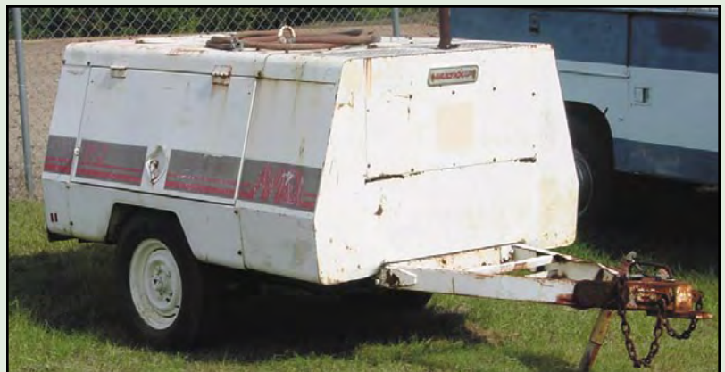
MULTIQUIP MDL. P-180 PORTABLE AIR COMPRESSOR