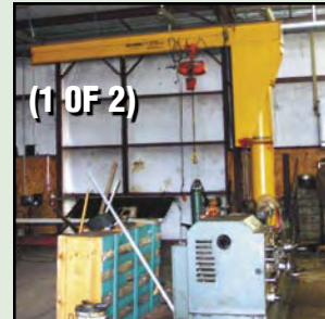
GORBEL JIB CRANES