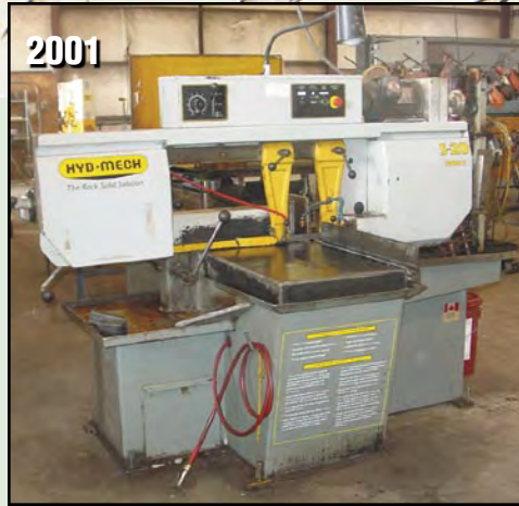
2001 HYD-MECH S-20 SERIES II 13" x 20" CAPACITY 1" BLADE HORIZONTAL BAND SAW