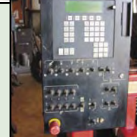
KOIKE ARONSON HYBRID-D10 PLUS CONTROLS