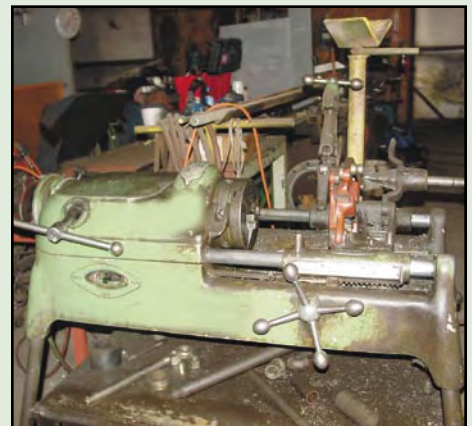
RIDGID 500 POWER THREADER