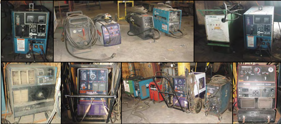
PARTIAL VIEW OF WELDERS