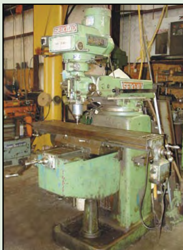
SEIKI-XL MDL. 3VH VERTICAL MILLING MACHINE