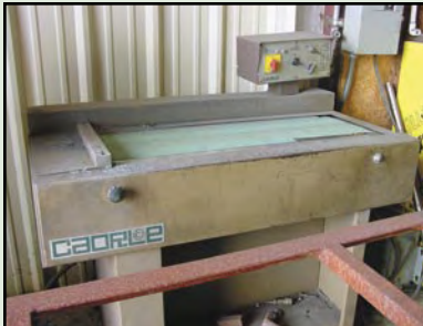
CAORLE HORIZONTAL BELT SANDER