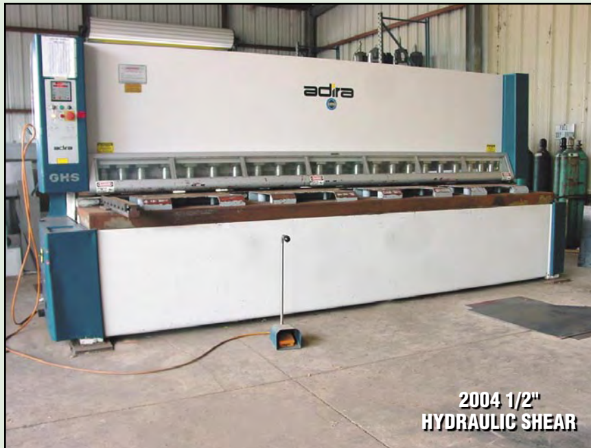
2004 1/2" HYDRAULIC SHEAR ADIRA MDL. GHS-1350 1/2" X 13' HYDRAULIC POWER SQUARING SHEAR