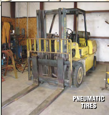
HYSTER MDL. H90XL 9,400-LB. CAP. FORKLIFT