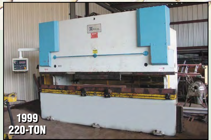
1999 220-TON PRIMELINE MDL. HAP37200 220-TON X 12' HYDRAULIC PRESS BRAKE