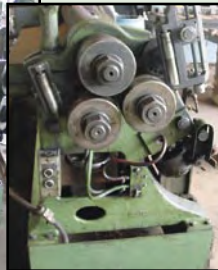
ANGLE ROLL ATTACHMENT