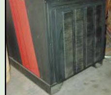
HYPERTHERM MAX 200 PLASMA POWER SOURCE