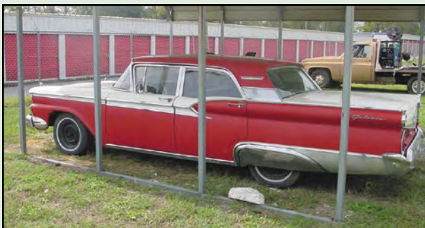
< 1959 FORD GALAXIE 500