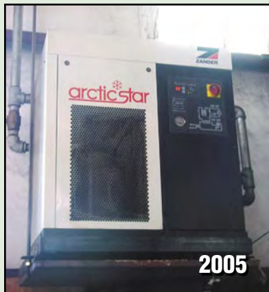
ZANDER MDL. AS400 AIR DRYER