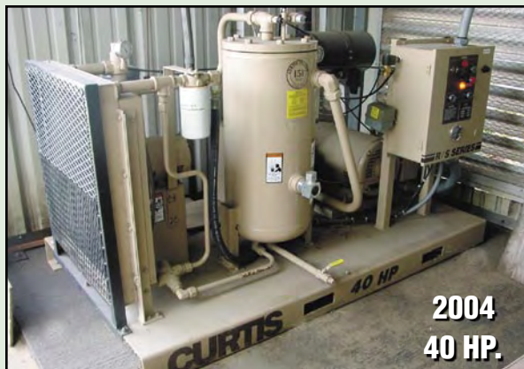
CURTIS MDL. R1540 A/E E-12 ROTARY SCREW AIR COMPRESSOR