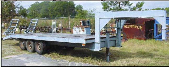
24' GOOSENECK TRAILER