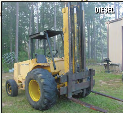
JOHN DEERE TRACTOR STYLE 6,000-LB. CAP. FORKLIFT