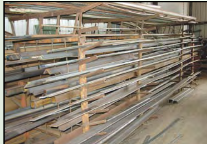
PARTIAL VIEW OF STRUCTURAL METALS