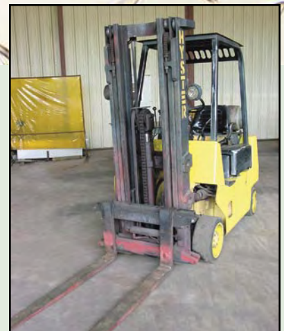
HYSTER MDL. 550XL 5,400-LB. CAP. FORKLIFT