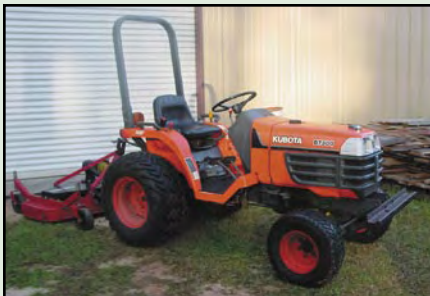
< KUBOTA MDL. B7300 HSD TRACTOR