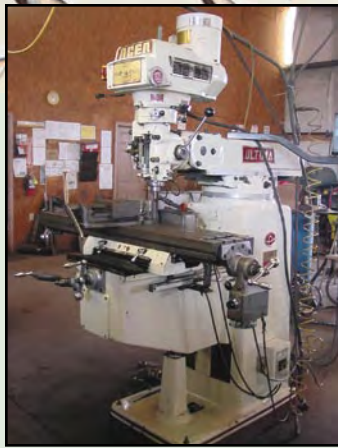
ACER MDL. 3VK ULTIMA VERTICAL MILLING MACHINE