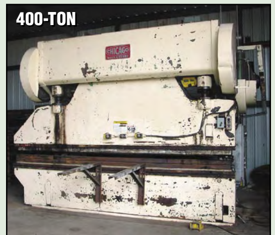
400-TON CHICAGO DRIES & KRUMP MDL. 610-D 400-TON PRESS BRAKE

KR WILSON Mdl. 3700-AB Hydraulic 4-Post Press, 150-ton, 42" x 28" table, 6" ram, 19" stroke, s/n 3045.