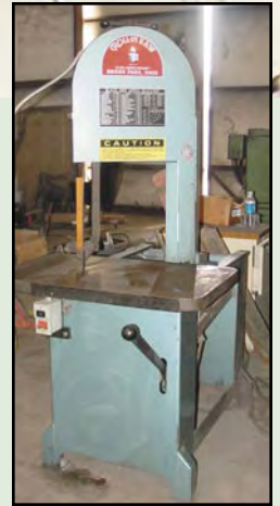
ROLL-IN SAW VERTICAL BAND SAW