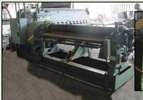
ROLSHEAR INC. MDL. 4-E 1/4" x 72" CAPACITY POWER PLATE ROLLS, w/ANGLE ATTACHMENT