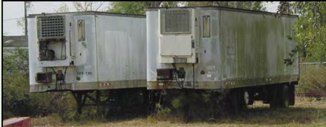
(2) FRUEHAUF 40' REFRIGERATED THERMO KING VAN TRAILERS