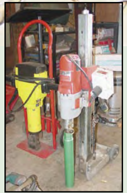
CORE DRILL & JACKHAMMER