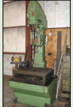
AVERY DRILL PRESS