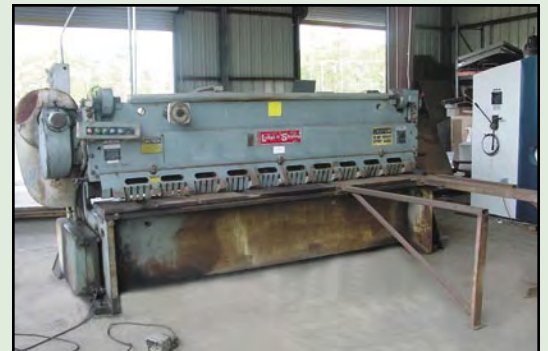
LODGE & SHIPLEY MDL. S-0410-SL 1/4" x 10' CAPACITY POWER SQUARING SHEAR