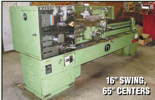
CLAUSING NARDINI ND 1560E GAP BED LATHE