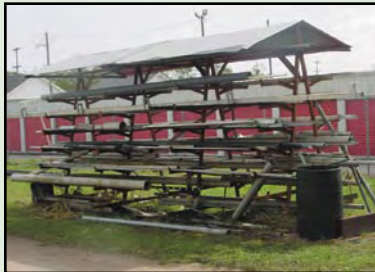
PARTIAL VIEW OF STAINLESS STEEL & ALUMINUM STOCK