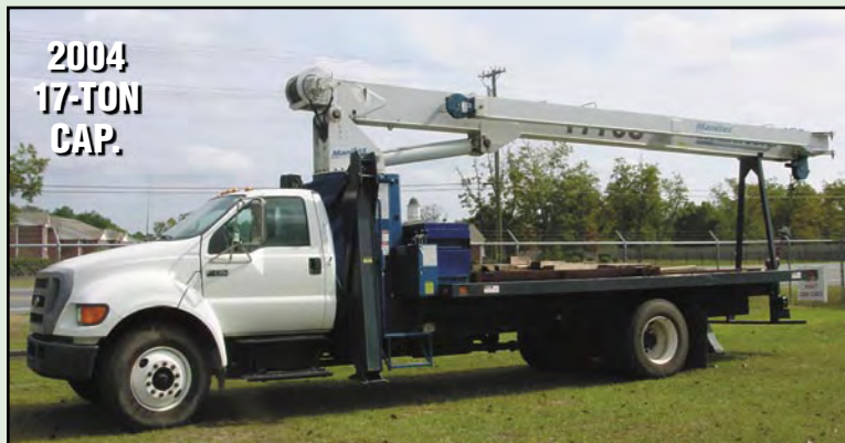
2004 FORD F-750 XL SUPER DUTY CRANE TRUCK, 17-TON CAP.

Commuting Area: 73,413 Average Wage as of 2004 Coffee County: Manufacturing $556/Week Source: Georgia Area Labor 2005, Bureau of Labor Statistics