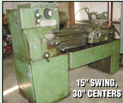
LEBLOND ENGINE LATHE