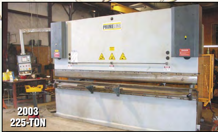
2003 225-TON PRIMELINE MDL. 22512 225-TON X 12' HYDRAULIC PRESS BRAKE