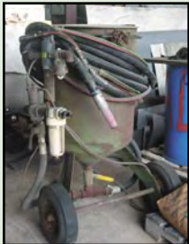
CLEMCO INDUSTRIES MDL. 2452 SAND BLAST POTS.