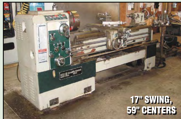
< SOUTH BEND 450 LATHE