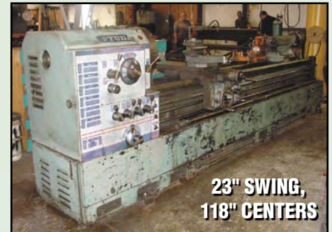
TUDA EL GAP BED LATHE