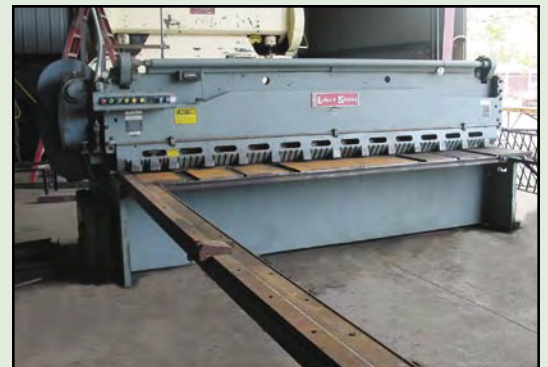
LODGE & SHIPLEY MDL. S-0412-SL 1/4" x 12' CAPACITY POWER SQUARING SHEAR