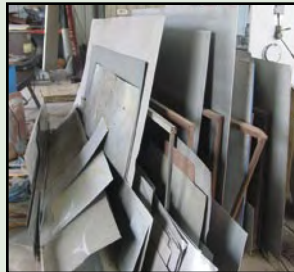
PARTIAL VIEW OF PLATE STOCK