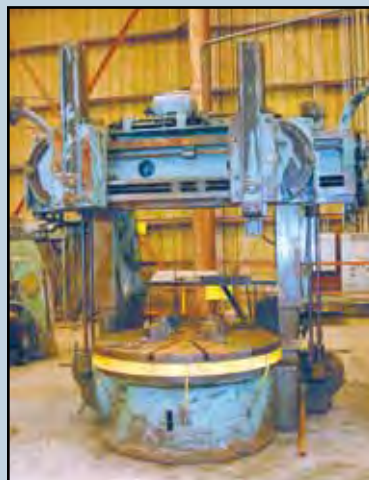
KING Vertical Boring Mill , 60" chuck, (2) heads, 44" under rail.