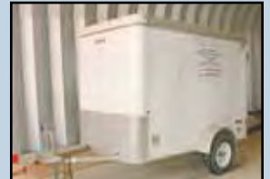
5' x 8' Covered Trailer .