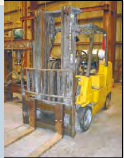
CATERPILLAR Mdl. GC45 Forklift , 10,000-lb. cap., 3-stage mast, LP gas, side shift, S/N 818701199.