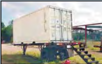
20' Customized Job Container .