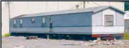
House Trailer , 16' x 80'.