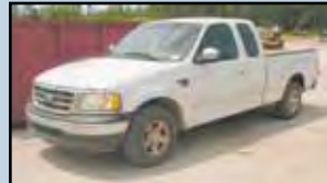
2000 FORD F-150 , V-8, 216,000 miles, S/N 1FTRX175L5YNA75302.