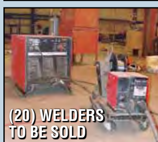
(20) WELDERS TO BE SOLD