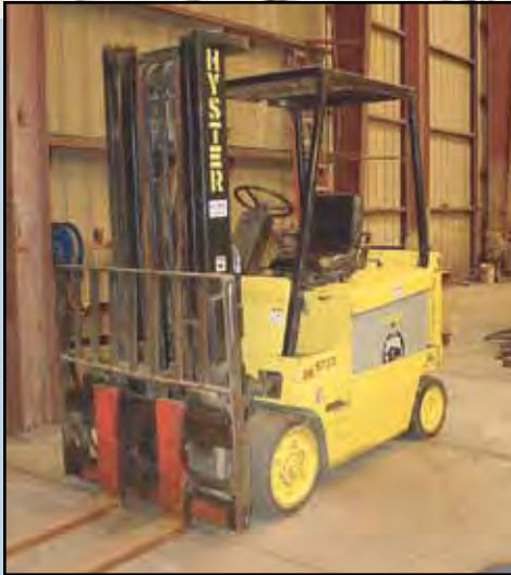
HYSTER Mdl. E 80 XL Electric Forklift , 7,500-lb. cap., 2-stage mast, side shift, S/N C0988V06346X.