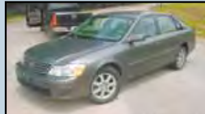
2004 TOYOTA Avalon , 140,000 miles, S/N 4T1BF28B04U388530.