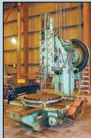
BETTS Vertical Shaper , 41" table, 25" under head.