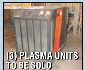
(3) PLASMA UNITS TO BE SOLD