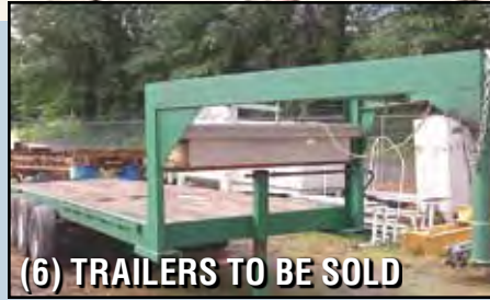
(6) TRAILERS TO BE SOLD