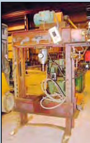
ARROW Hydraulic Press , 150-ton cap.