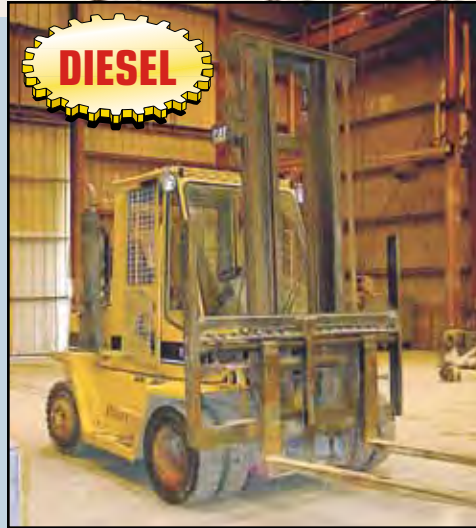
CATERPILLAR Mdl. V155C Forklift , 15,000-lb. cap., diesel engine, dual cushion tires, 8' forks, SS, S/N 8T600340.