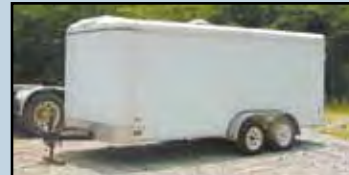
2008 7' x 16' Covered Trailer , tandem axle.