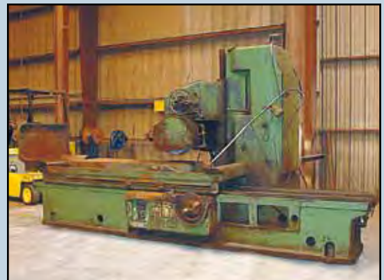
HILL ACME 72" x 24" Horizontal Grinder , S/N G363.