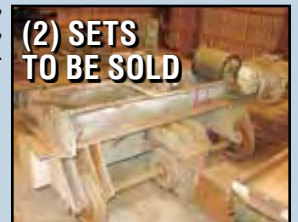
(2) SETS TO BE SOLD