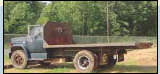
1990 CHEVROLET Series 70 Truck , w/stakebed, tandem, dual wheels, 45,000 miles, S/N 1GBG7B1B4LBS06575.