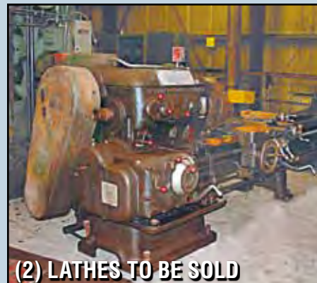
(2) LATHES TO BE SOLD