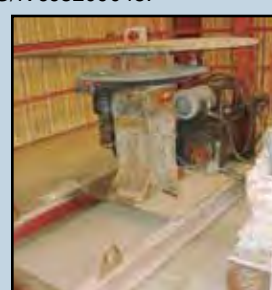
500-Lb. Hydraulic Power Weld Positioner , 64" table.