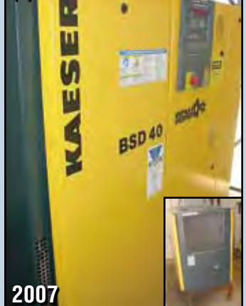
(4) COMPRESSORS TO BE SOLD