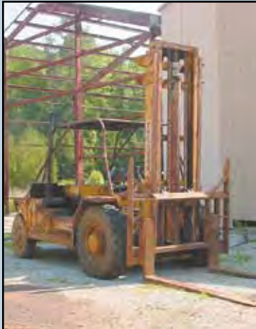
FULGHUM Forklift , 20,000-lb. cap., pneumatic tires, 8' forks, S/N 2BP1800.