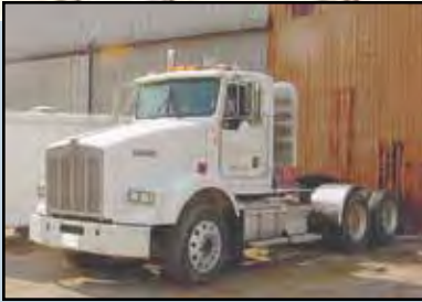
1999 KENWORTH Truck Tractor , Detroit Series 60 engine, 10-spd., 569,000 miles, S/N 1XKBBR9X4XJ83.