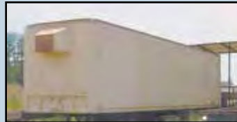
45' Customized Job Trailer .