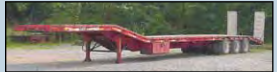
CLARK 53' Drop Deck Trailer , 3-tandem axle, 80,000-lb. cap., S/N 1CD2C533TA004517.